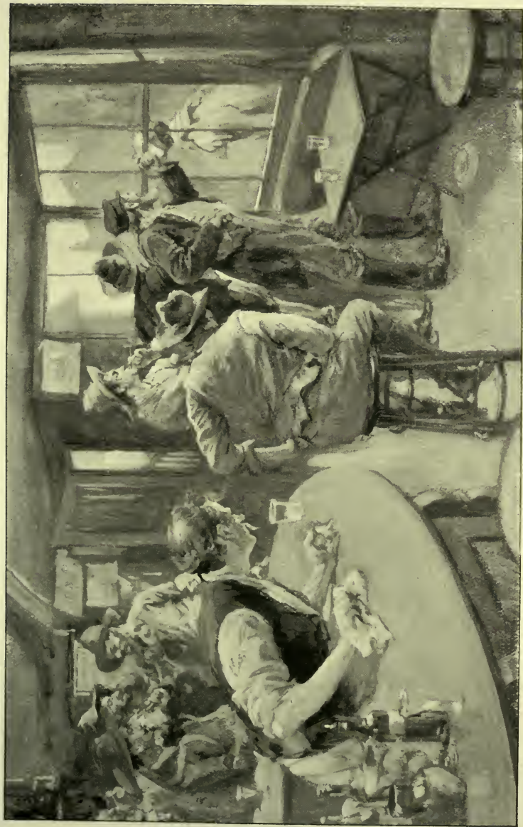
They were all startled at the apparition of Mrs. Barker.